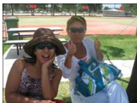
Above: Some of our Japanese guests enjoying the Semi Final action